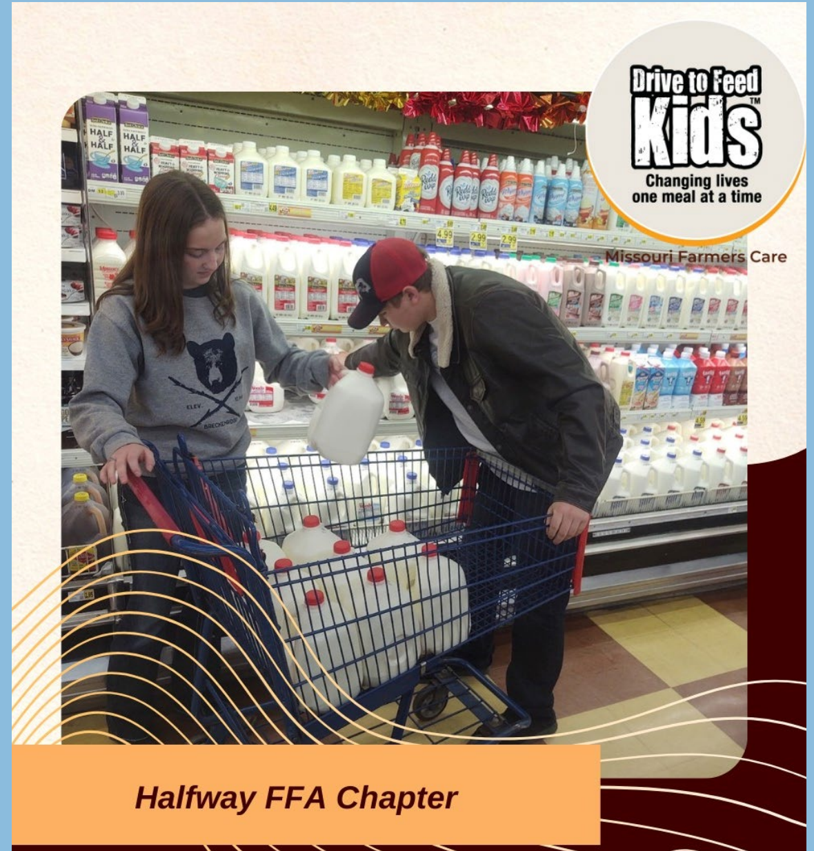
Halfway FFA Chapter