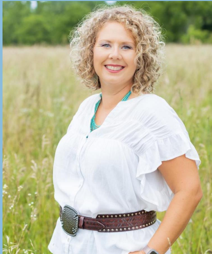
Emma Hohenberger Foundation for Food and Farm Connections