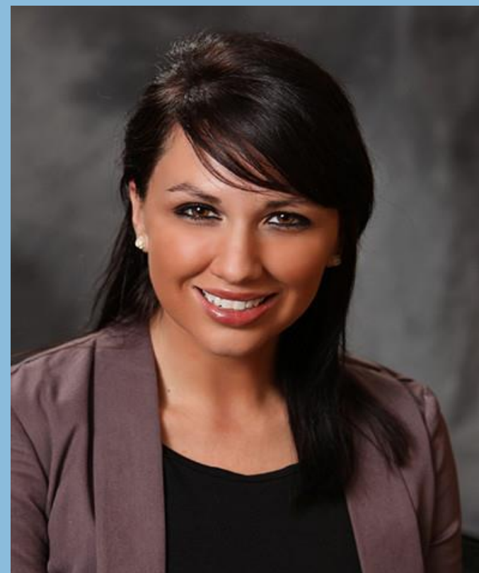
Luella Gregory Foundation for Food and Farm Connections